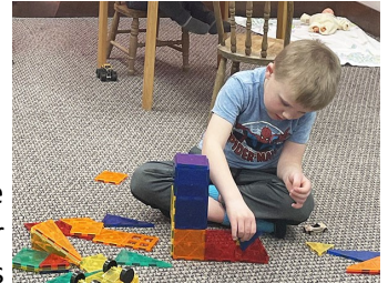
A child in the care of Children's Disaster Services at a center in Lakeview, Ohio, following tornadoes.