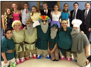
Cast for a Cause