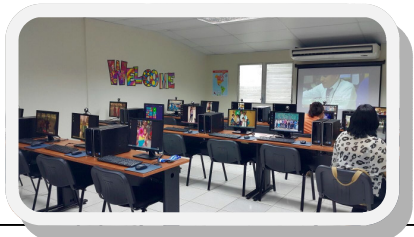
Inside the new computer lab

Much funding is still needed to provide staffing and supplies for infant care. If you find it in your heart to make it possible for us to reach out to even more infants like baby Ashley, please consider donating to our NURSERY FUND.