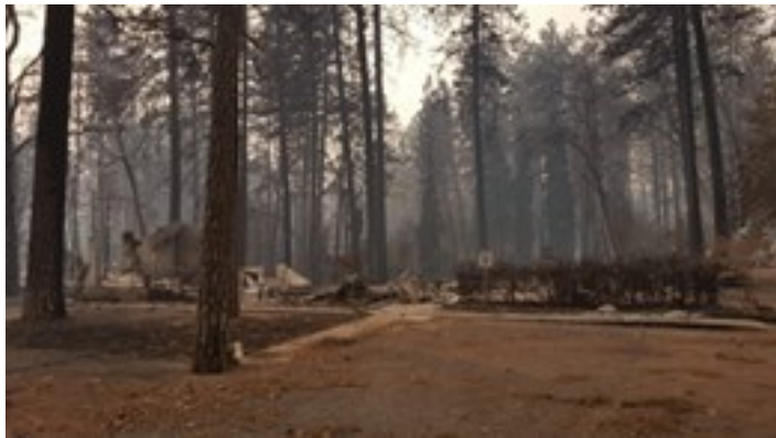
Paradise Church of the Brethren—after

later the fire was only 45 percent contained but had already covered 142,000 acres and destroyed nearly 12,000 structures, most of which were single-family homes. The death toll as of November 15 was 63, that has since grown to 79 and the list of missing people has reached 699. One of the structures destroyed in the fire was the Paradise Church of the Brethren along with its other buildings, including the parsonage. The