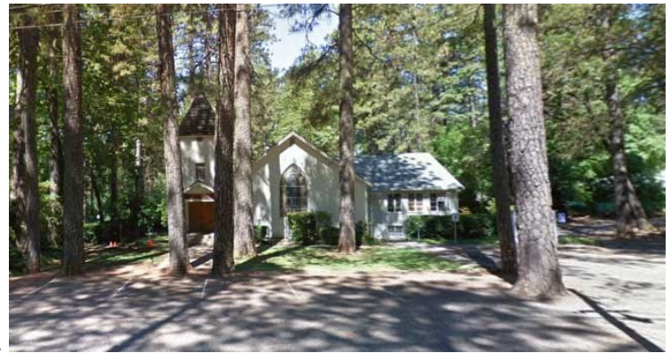
Paradise Church of the Brethren—before

go to www.brethren.org for the most complete and up to date news from the Church of the Brethren