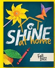
SHINE AT HOME