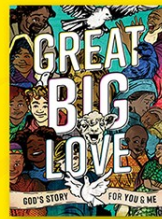
GREAT BIG LOVE