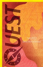
JUNIOR YOUTH Quest Devotional